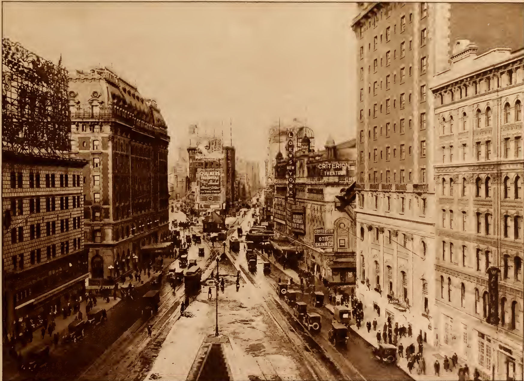
BROADWAY AT 44th STREET. On the right the Hotel Claridge, on the left, the Hotel Astor. At night this part of the thoroughfare is ablaze with electric lights and is famous as the Great White Way. Within a radius of three blocks are dozens of amusement places.